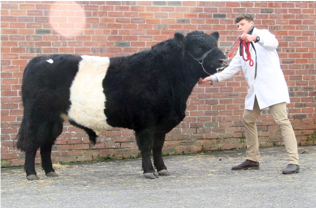
Top Priced Male Clifton Ace 8000gns