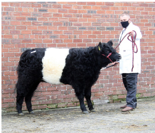
Whitstonehill Gysell 4000gns