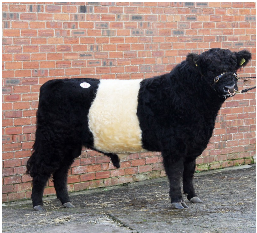
Lomond Craiglachie 6500gns