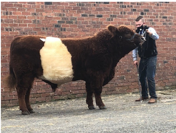
Croft Red Admiral 4200gns