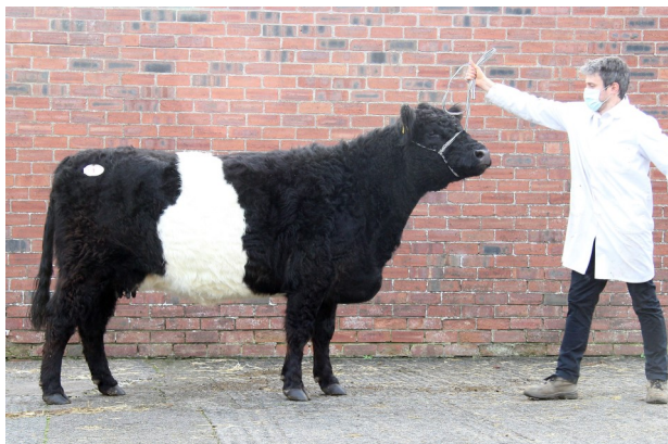
Top Priced Female Huntfield Uppy and her heifer calf 6000gns