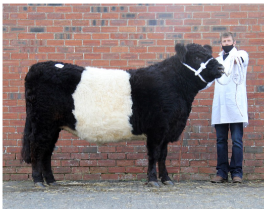
Briglands Tequila 4000gns